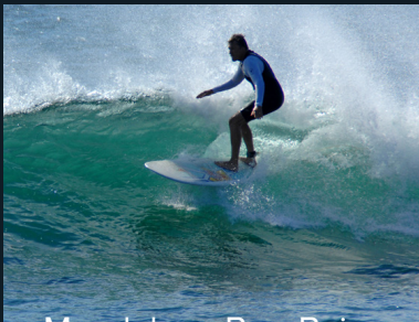
Magdalena Bay, Baja