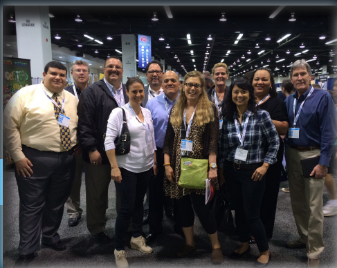
A group of 15 staff members visited WonderCon Anaheim early April to familiarize themselves with the event.

It took the excellent teamwork between the LATCB, LACC, CTD, AEG Corporate and the Mayor's office to land this great piece of business, and it will take excellent teamwork to successfully host WonderCon next March. Something I know we can deliver.